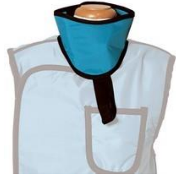
Thyroid collar shield