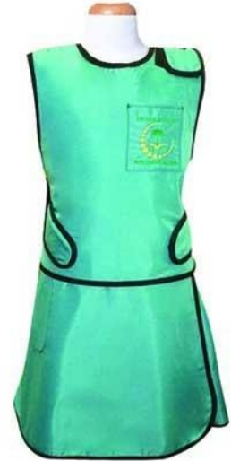
Overlap skirt with vest