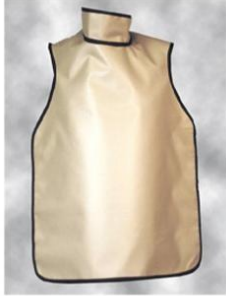
Apron with integrated thyroid collar shield