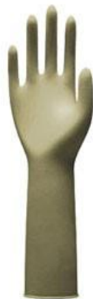
Radiation Protection Gloves