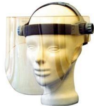
Leaded protective mask

Providing eye protection against scatter radiation.