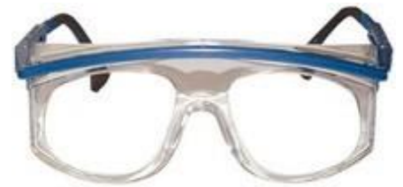
Protective leaded eyewear

Lead glasses provide x-ray protection for the eyes.