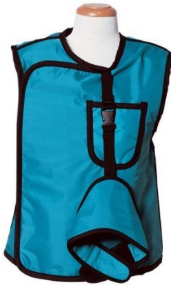
Apron with matching separate thyroid collar shield