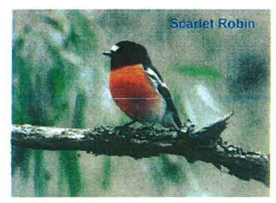
Scarlet Robin male

South-east mainland Australia, Tasmania south-eastern South Australia and south west Western Australia.