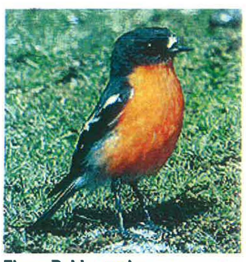
Flame Robin - male

South-east mainland Australia and Tasmania