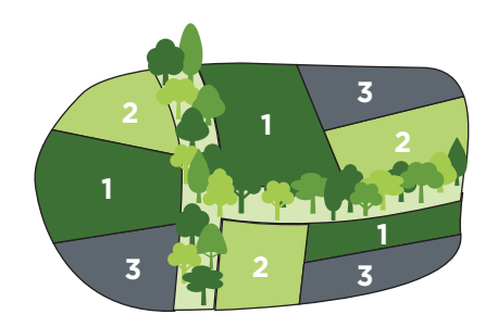
Cycle 1: Year 0-10