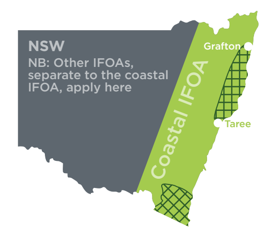
Figure 1: harvesting practices across the Coastal IFOA region.