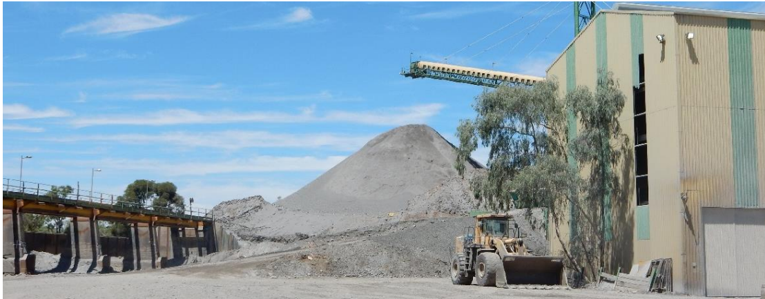
Photo 11: Large ore stockpiles such as this one from an underground mine often cause dust problems.