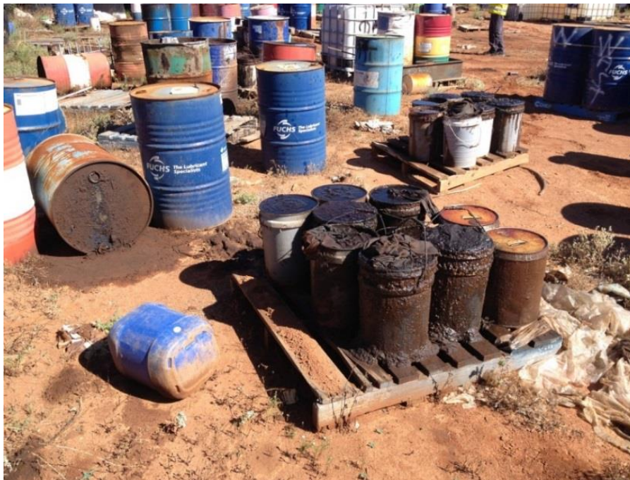
Photo 14: Waste oils and other chemicals being stored with no secondary containment. There is evidence of leaks and spills and unlabelled containers.