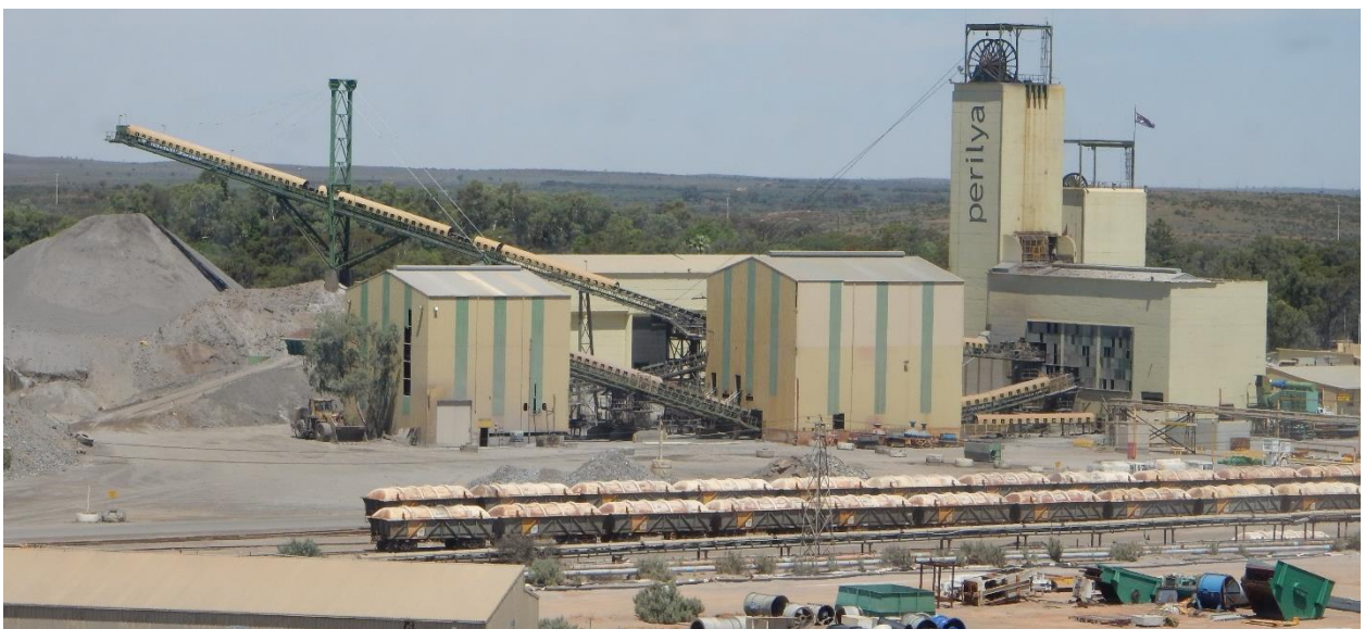
Photo 6: Perilya Southern Operations, Broken Hill (underground mining)