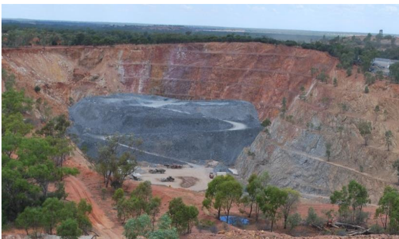
Photo 7: Tritton Copper Mine, Girilambone (open-cut mine containing underground mine entrance portal)