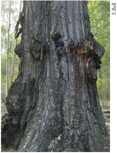
Broad-leaved Ironbark trunk

These guidelines provide background information to assist landholders to identify remnants of Lower Hunter Spotted Gum-Ironbark Forest. For more detailed information, refer to the NSW Scientific Committee's Determination Advice at <a href="http://www.nationalparks.nsw.gov.au/npws.nsf/Content/Final+determinations">http://www.nationalparks.nsw.gov.au/npws.nsf/Content/Final+determinations</a>