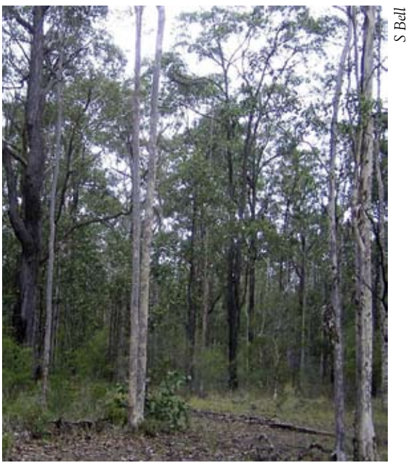
Portrait view of EEC

Only a very small percentage (about 10%) of the original extent of Lower Hunter Spotted Gum – Ironbark Forest remains. The remaining areas are small and highly fragmented occurring mostly as small patches of less than 10 hectares. Much of the remaining areas of this community are threatened by clearing, timber harvesting, coal mining, weed invasion, frequent fires, grazing and cropping. A number of threatened plants may be present in this community including Netted Bottle Brush (Callistemon linearifolius), Small Flower Grevillea (Grevillea parviflora subsp. Parviflora) and Heath Wrinklewort (Rutidosis heterogama).