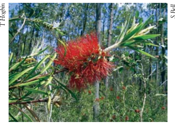
Netted Bottle Brush (Callistemon linearifolius)

Disclaimer: The Department of Environment and Climate Change has prepared this document as a guide only. The information provided is not intended to be exhaustive. It does not constitute legal advice. Users of this guide should do so at their own risk and should seek their own legal and other expert advice in identifying endangered ecological communities. The Department of Environment and Climate Change accepts no responsibility for errors or omissions in this guide or for any loss or damage arising from its use.