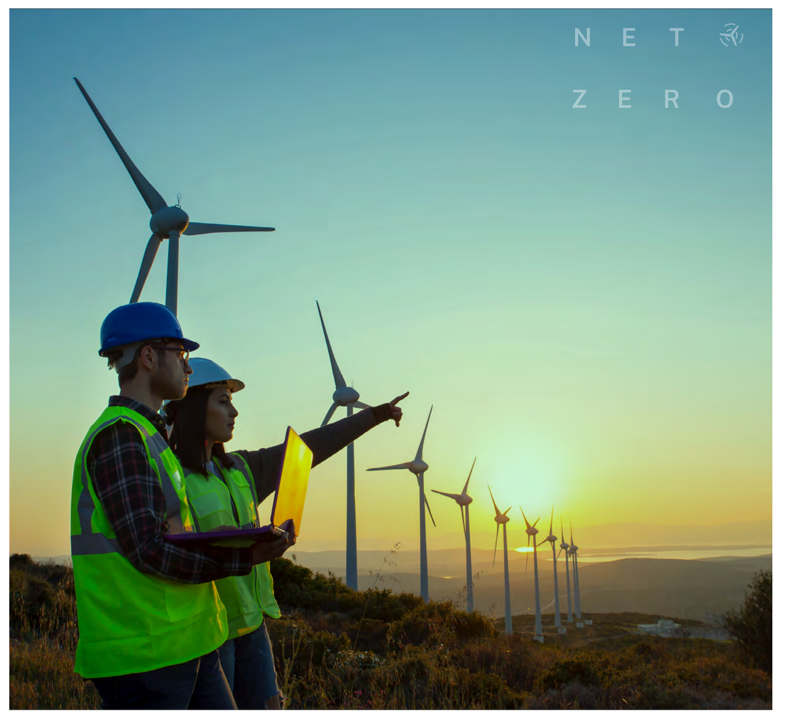
Renewable energy and clean tech opportunities in New South Wales

Energy intensive manufacturing, value-add agricultural production, recycling, and freight and logistics.