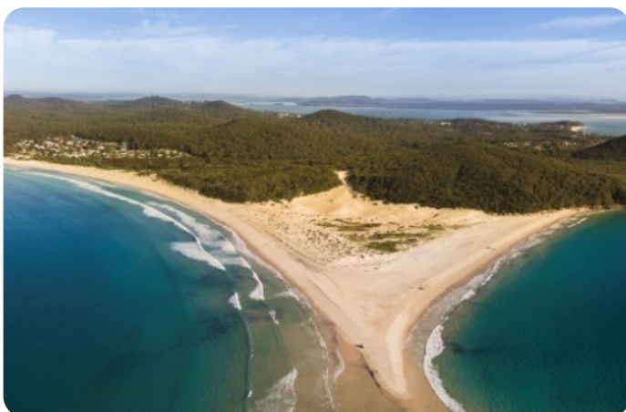
Fingal Spit, with Shoal Bay on right, and Fingal Bay on left – Shark Island.

To learn more, email us at litter.prevention@epa.nsw.gov.au .