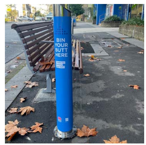
Talking to local government staff involved with city services, operations cleansing or waste may help you find a smoking area suitable for comparing disposal actions.