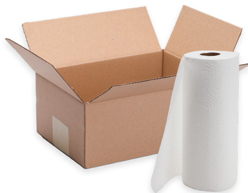
Paper and cardboard