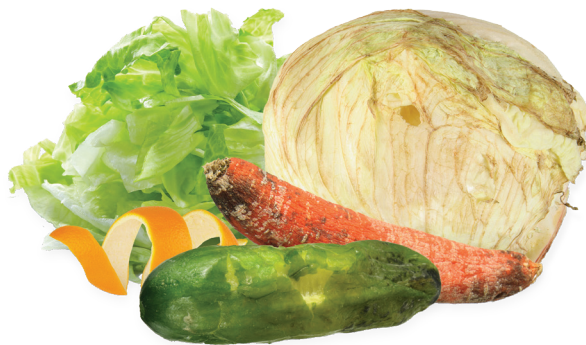
Fruit and vegetable scraps