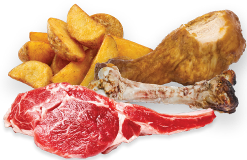
Meat, bones and cooked leftovers