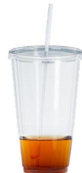
Cups and lids with straws