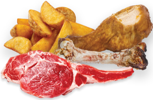
Meat, bones and cooked leftovers