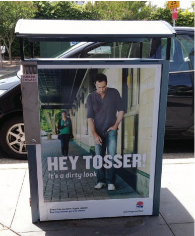
Vandalised old bin