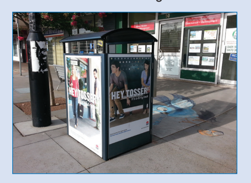
New bins installed