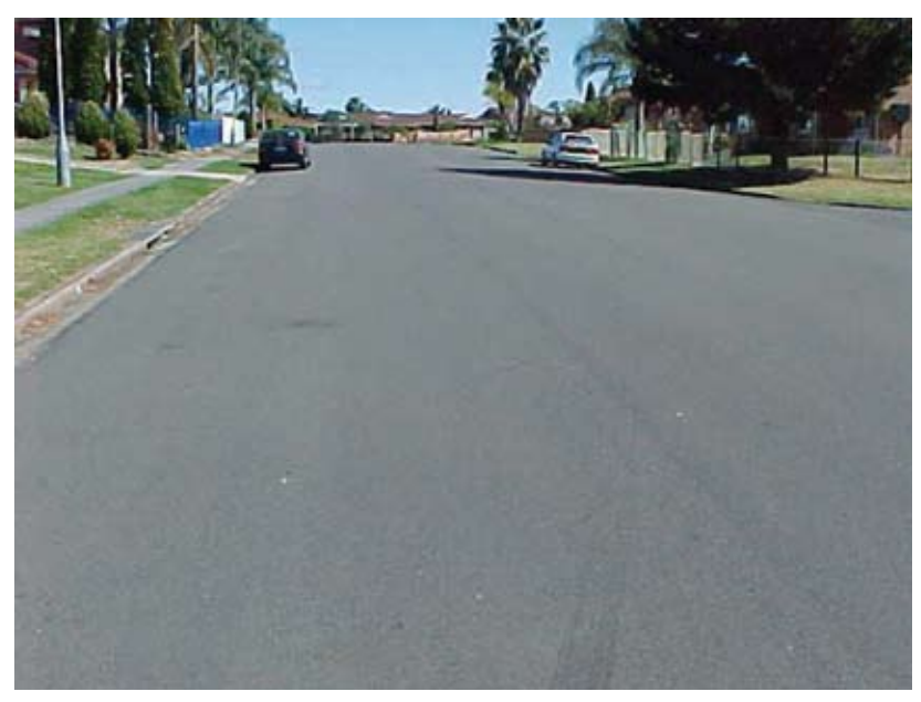
Photo 3. Delgarno Road - Road condition 7 years after the rehabilitation work