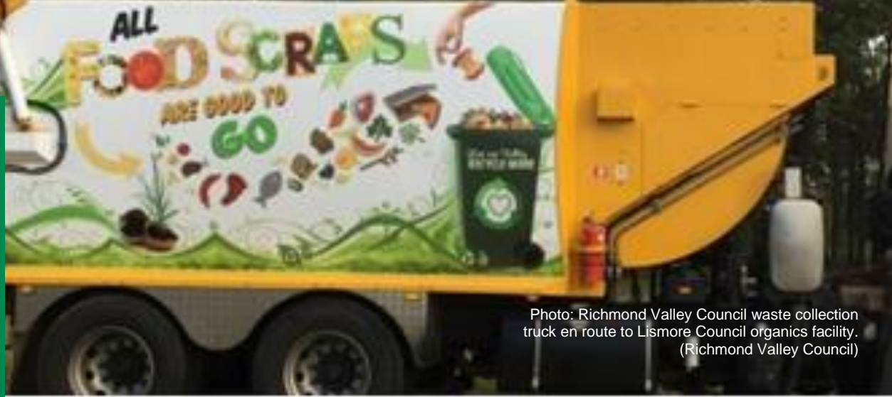
Photo: Richmond Valley Council waste collection truck en route to Lismore Council organics facility.

Richmond Valley Council, in the Northern Rivers region of north-east NSW, services a largely rural area of 3,051 square kilometres, with most industries involving cattle or crops (such as sugar cane, wheat, pecans, fruits, vegetables, timber and tea-tree).