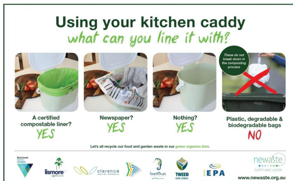
Image: Instructions on how to use the council provided kitchen caddy (Richmond Valley Council)