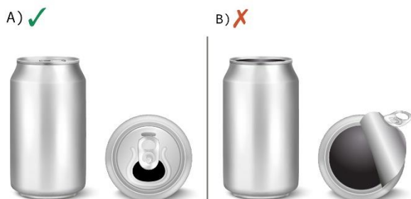
Picture A shows an eligible metal container with a stay-tab opening. Picture B shows a prohibited removable end lid.

Removable ring-pull lids are a unique opening mechanism typically used for craft beer cans and energy drinks.