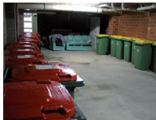
Layout of bins and bulky items within the storage area