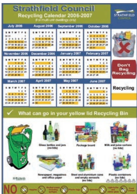
Recycling calendar displayed in the storage area