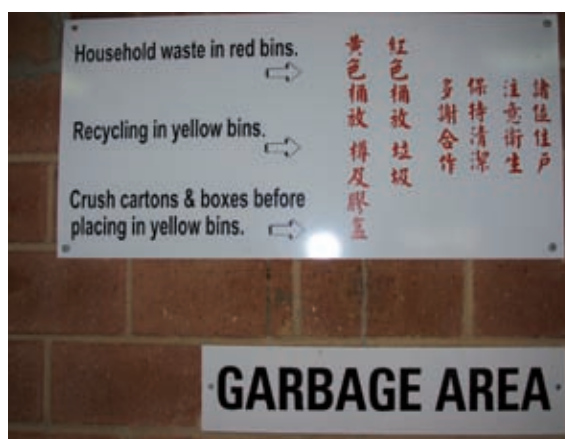
Education material in multiple languages