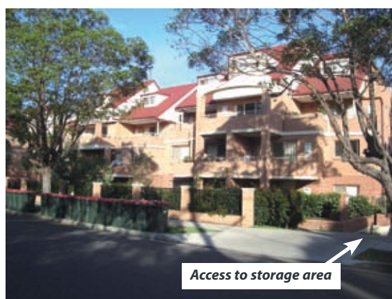
Bins placed out on the kerbside for collection