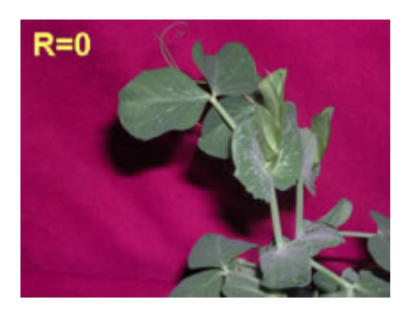
Figure 6.1. Example of a pea bioassay showing response to symptoms of clopyralid damage of varying concentration. R=0 is an uncontaminated control and R=5 shows severe damage (Washington State University, 2003). Observable physiological effects as a result of herbicide damage to the plants range from slight cupping and twisting of leaves, curled cotyledons and first leaves, crooked or bent stems, reduced development of leaves and loss of apical dominance, to extreme cases of poor germination, no leaf development and cessation of plant growth.