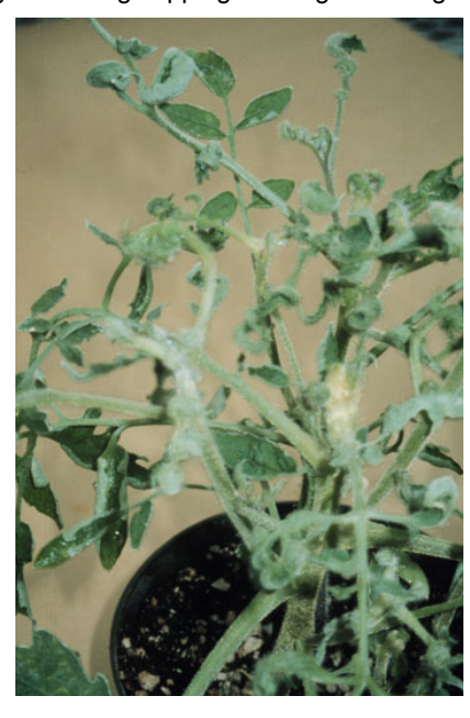
Figure 2.1. Typical clopyralid damage including cupping and slight twisting of leaves (Bezdicek et al., 2000).