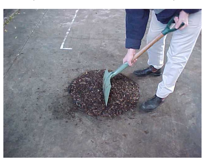
Plate 3. Sub-sampling of the combined sample by coning and quartering. The combined sample is formed into a cone, and divided into quarters.

A convenient way of posting the packaged samples is in a polystyrene box.