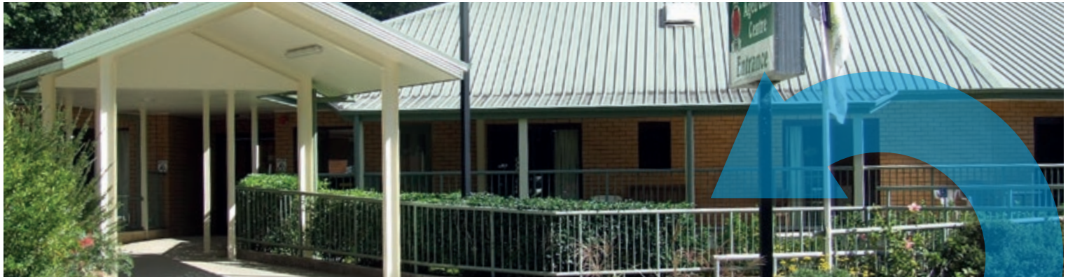
Royal Freemasons' Benevolent Institution – Bellorana Aged Care Facility, 2013