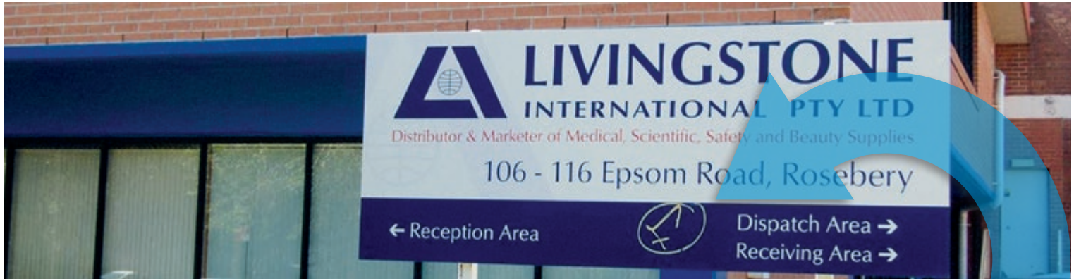
Livingstone International Pty Ltd, 2013