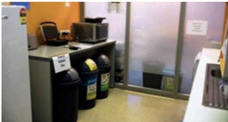
Independent Transport Safety Regulator, 2013