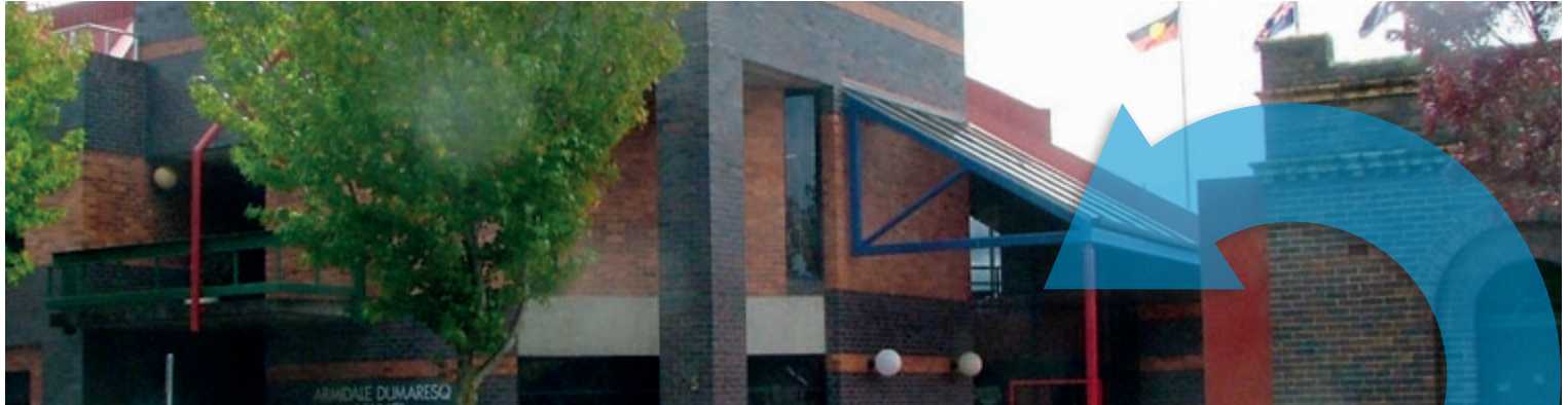
Armidale City Council, 2013