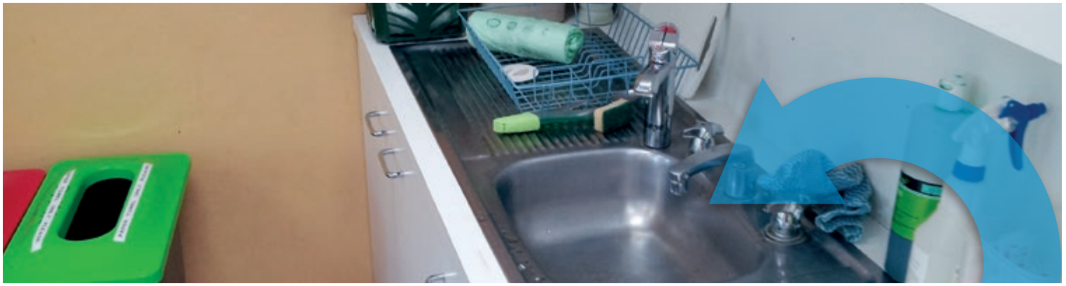
Armidale City Council, 2013

recycling stations in the staff kitchens and across the floor. After three months, extra paper towel bins were installed in the kitchens to meet demand and to prevent the organics bins from filling up too quickly.