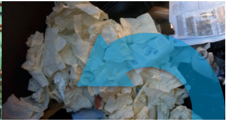
Australian Beverage Corporation, 2013