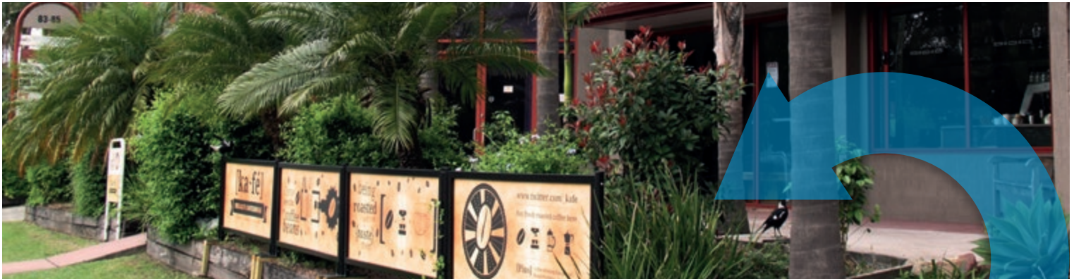
Australian Beverage Corporation, 2013