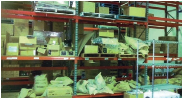
Australian Beverage Corporation, 2013