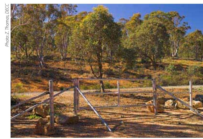
One of the vandal-resistant gates installed on land owned by Ngunnawal LALC

There are also more details on this project in the sample press release in Appendix 3.