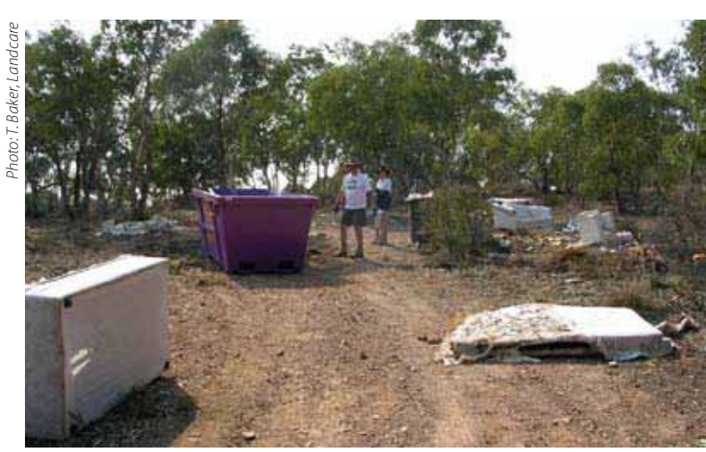
Cleaning up the land with the help of the community and a large skip