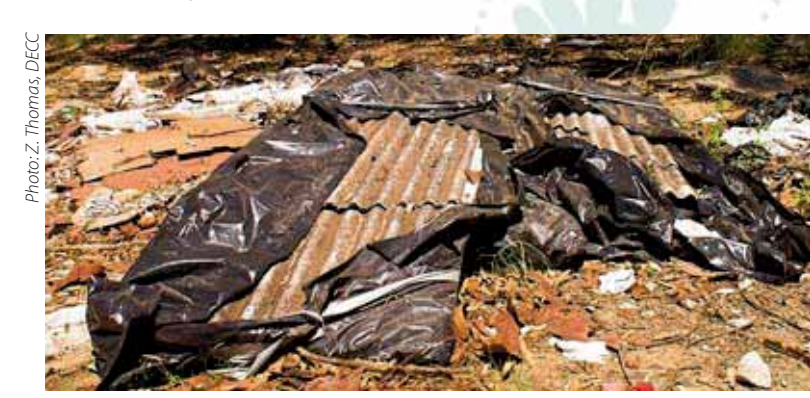
Dumped asbestos sheeting

If dumped waste may pose a health risk, contact DECC on 131 555 or your local council for advice on clean-up and disposal. Your local fire authority may also be able to help. Illegally dumped waste that may pose a health risk, such as chemical drums or asbestos, should only be investigated by appropriately trained people.