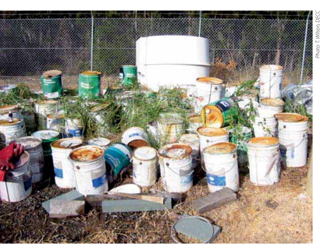
Illegally dumped paint and chemical drums

Some landholders may allow people to dump waste on their property in return for money or as a favour. This practice is illegal as approvals to dispose of waste are needed from the local council, and sometimes DECC.