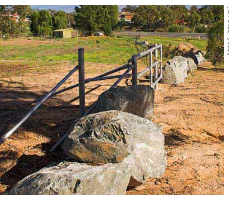
Boulders and a locked gate prevent vehicles from entering land owned by Ngunnawal LALC, Queanbeyan

Earth mounds may be more likely to be accepted by the community as they can fit in with the natural environment, do not attract graffiti and can prevent vehicles from entering a site. Mounds can be formed from earth taken from your site. Imported material and illegally dumped materials may also be suitable for mound construction but they must be fit for the purpose, and pose minimal risk of harm to the environment and human health. Earth moving equipment will be required, the use of which can be costly. Some communities have received in-kind support in the form of equipment and a driver from partners such as their local council.