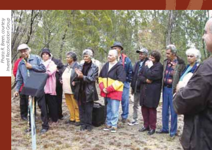
Nhunta Karra Kara walking track opening ceremony,