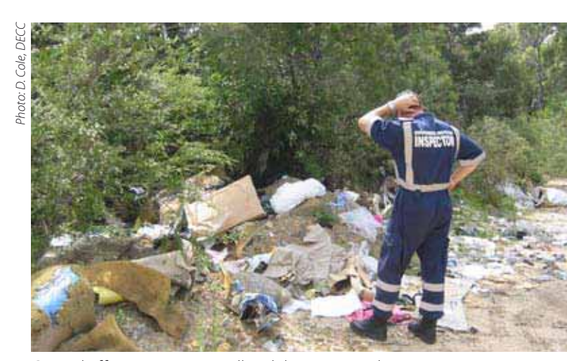
Council officer inspecting an illegal dumping incident

Report illegal dumping to authorities as soon as you become aware of it, and provide as much information as possible. If authorities can track down the dumpers they can issue them with penalties and make them clean up the dumped waste.