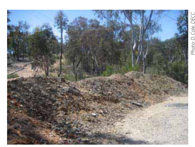
Earth mounds help stop vehicles entering land owned by Ngunnawal LALC, Queanbeyan

Wollondilly Shire Council, in partnership with a local Aboriginal community, used almost indestructible fence materials at a remote Aboriginal-owned site in Wedderburn to