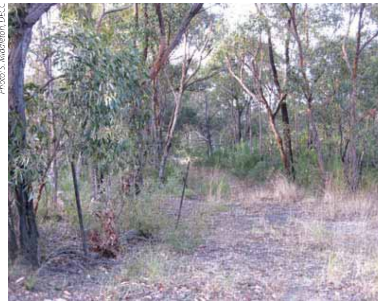
Before (top) and after (bottom) clean-up project on land owned by Gandangara LALC, Menai.