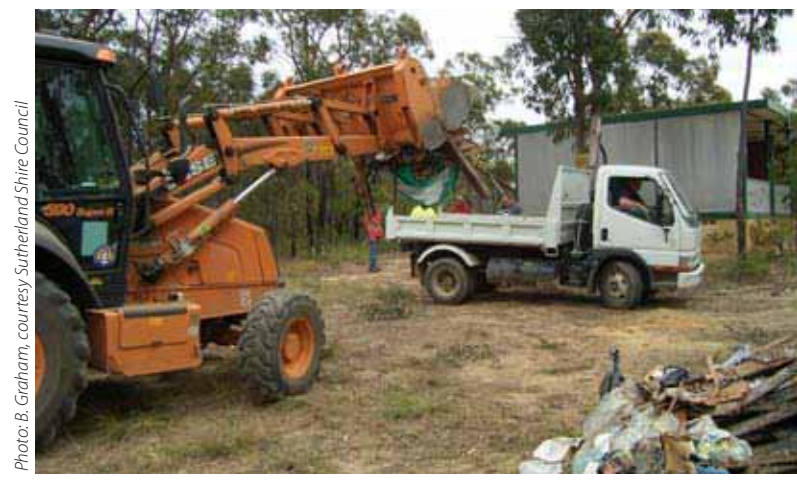
Using machinery to remove illegally dumped waste on land owned by Gandangara LALC, Menai