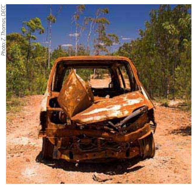
Dumped cars such as these can be taken to a scrap metal yard for recycling

The Karuah and Worimi LALCs, in partnership with Port Stephens Council, removed approximately 35 tonnes of building and garden waste from Aboriginal-owned land. A contractor provided bins and disposed of the waste to a licensed landfill. Fifteen tonnes of scrap metal were also salvaged and sold to a metal merchant.