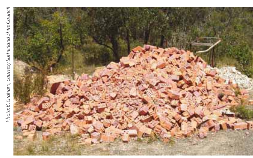
Construction waste was illegally dumped on land owned by Gandangara LALC, Menai

Provide training and improve employment opportunities for Community Development Employment Project participants.