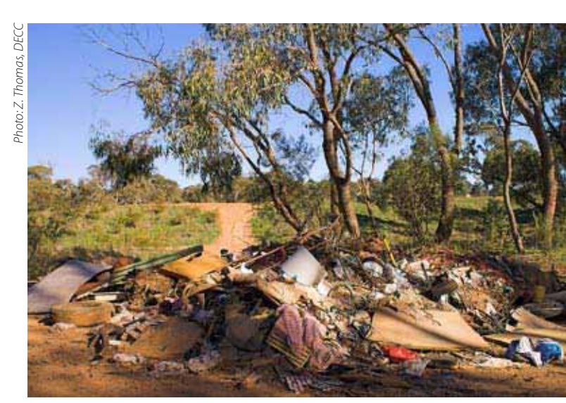
Large amounts of waste made up of various materials were dumped on land owned by Ngunnawal LALC

Grant funds of $50,000 were provided through the Clean-up on Aboriginal Owned Lands Program, a pilot project run by DECC. Generous in-kind support was also offered by the partners.