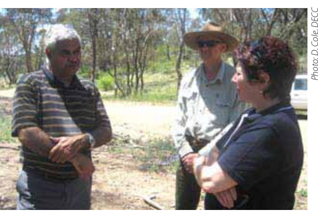
Representatives from Ngunnawal LALC, Queanbeyan City Council and DECC discuss the Mirrabee Clean-up Project, Queanbeyan

Local councils can offer assistance and support such as providing maps and aerial photos, helping you to obtain grant funding, contributing clean-up equipment, reusing and disposing of waste, helping promote projects and educating communities about illegal dumping.