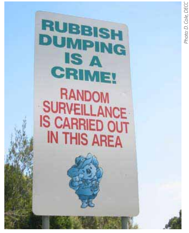
A Sutherland Shire Council sign reminding people that dumping is crime and the area is under surveillance