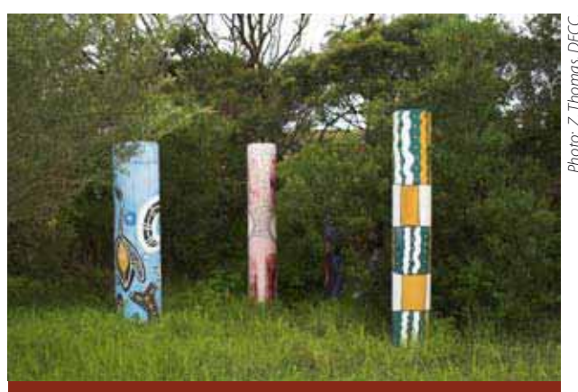
Totem poles at Coomaditchie Lagoon, Port Kembla

Council staff removed rubbish from a dumping place within the reserve boundary. DECC purchased native plants including bush tucker plants to rehabilitate the area. The local community, including schoolchildren, attended the planting day and a barbeque.