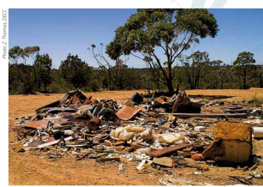
Illegally dumped domestic waste

The information in this handbook is summarised in a 13-minute DVD which is attached to the inside back cover. Extra DVDs are available from DECC's Environment Line – phone 131 555. The DVD also contains interviews with people involved in the pilot projects profiled in Chapter 4.