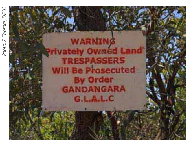
Sign warning trespassers to stay out of land owned by Gandangara LALC, Menai

Encourage your local council to put up signs on the edge of your land. Signs that state the area has been cleaned up in a joint project between Aboriginal communities and the government show that the land is important and illegal dumping will not be tolerated.