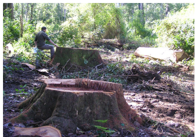
Old-growth Brush Box trees in endangered lowland rainforest illegally logged in Grange State Forest.

Of course the pitiful fine is essentially paid for by long-suffering taxpayers who, over the decade to 2015, have reportedly had to foot the bill for multi-million dollar losses in the Native Forestry division of Forests NSW/Forest Corporation every year but one, when they managed to scrape a small profit.