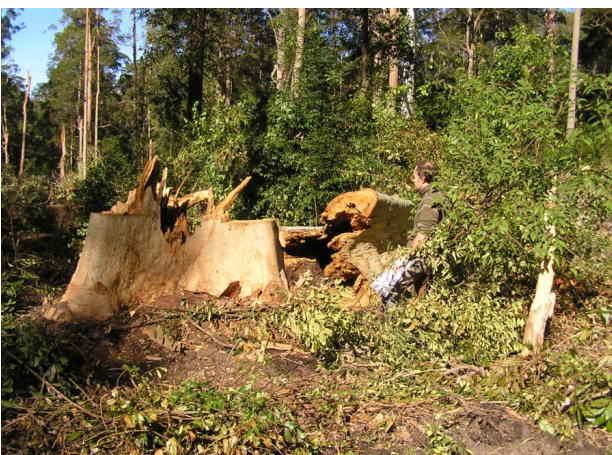
An estimated 500 year old Flooded Gum in Grange State Forest, producing only a 5m long hollow log.

That has essentially been happening, time and time again, for the past 18 years here on the NSW north coast as many hundreds of breaches were recorded by environment groups across the region.