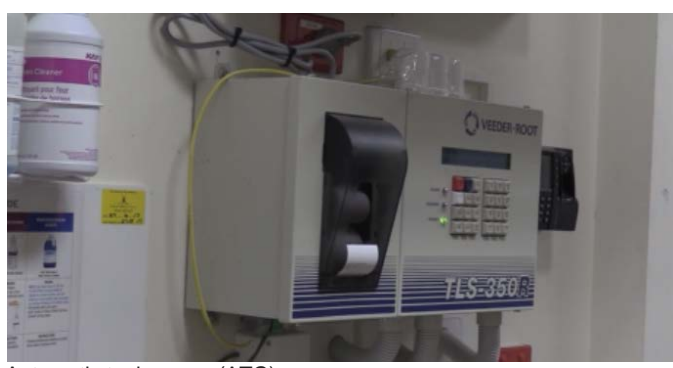
Automatic tank gauge (ATG)

accuracy, automated inventory reconciliation is the EPA's preferred loss monitoring method.