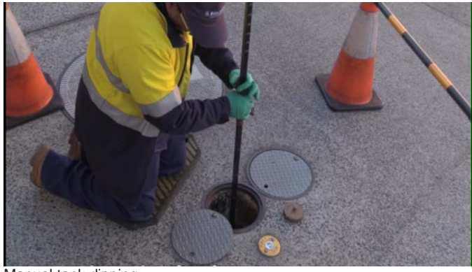
Manual tank dipping

Manual wet stock reconciliation is acceptable if the operator can demonstrate the process can detect any loss from the system at or above 0.76 litres per hour with at least a 95% accuracy.