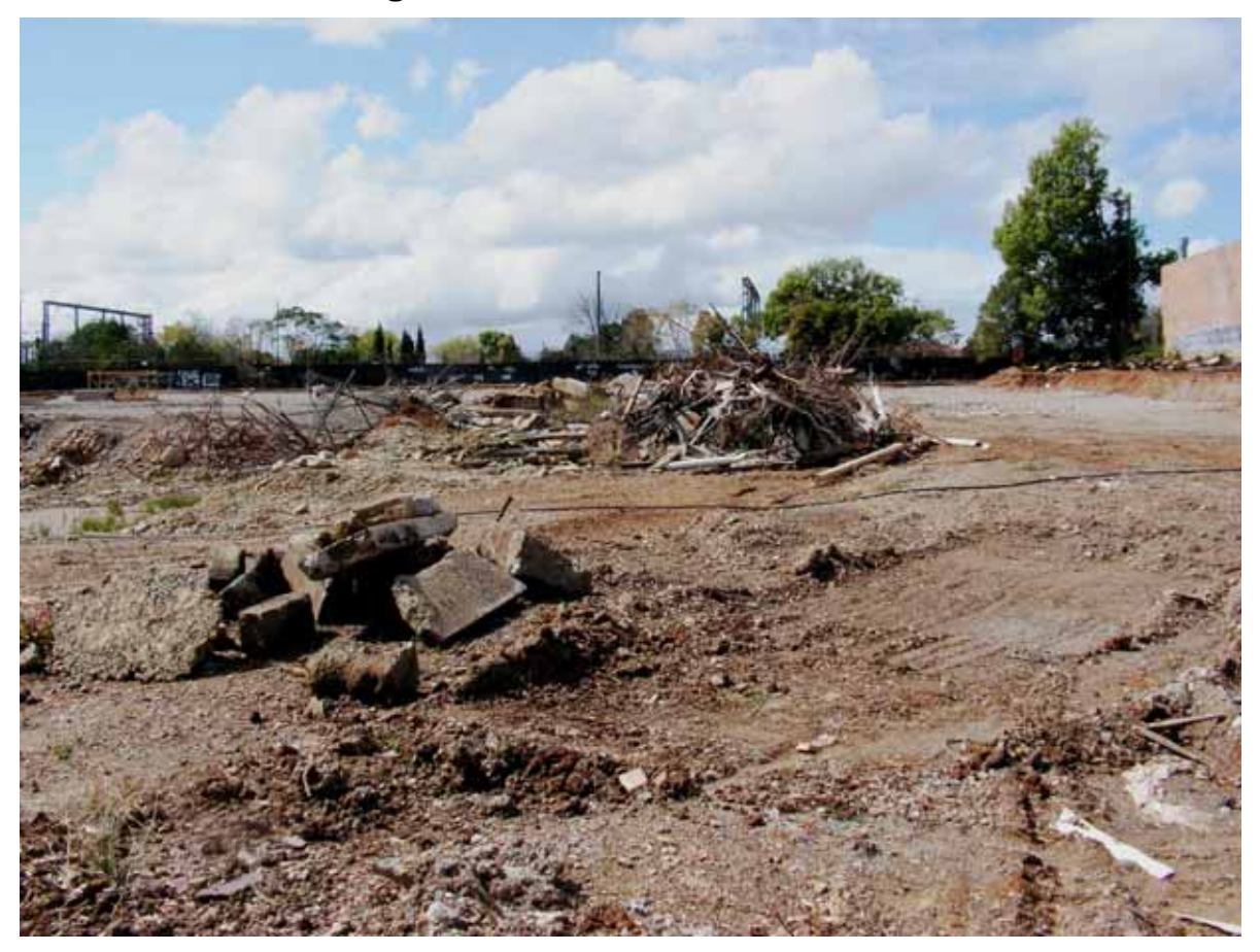
Ineffective dust management on a dormant construction site