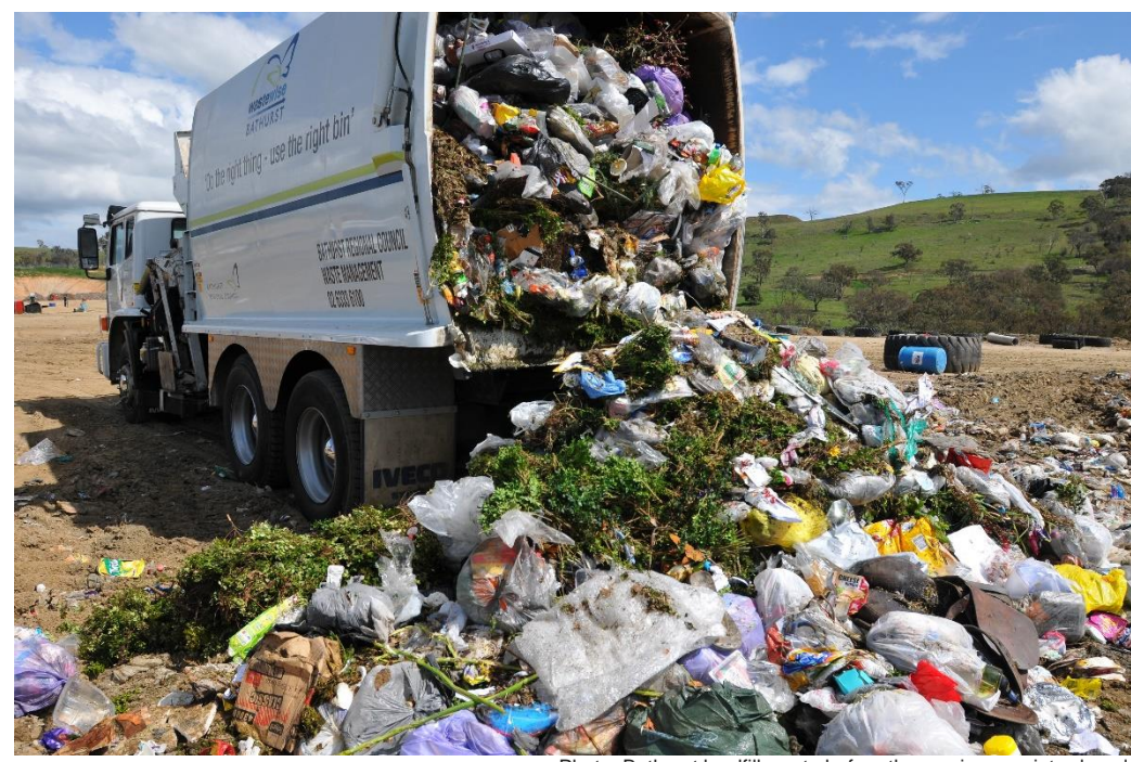
Photo: Bathurst landfill waste before the service was introduced.

'I think it's been wholly successful and it's been quite well received by the community.'