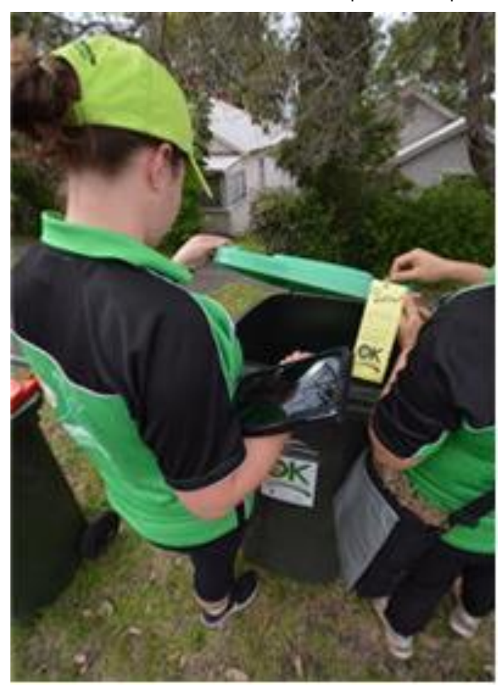
Photo: Contamination monitoring by the council's OK Organics Kiama team

With the implementation of the OK Organics Kiama program, which includes a weekly FOGO (green-lid) bin and fortnightly landfill (red-lid) bin, the Kiama municipality is achieving a resource recovery rate of 75%; a consistent 40% reduction in waste sent to landfill compared with pre-OK Organics Kiama.