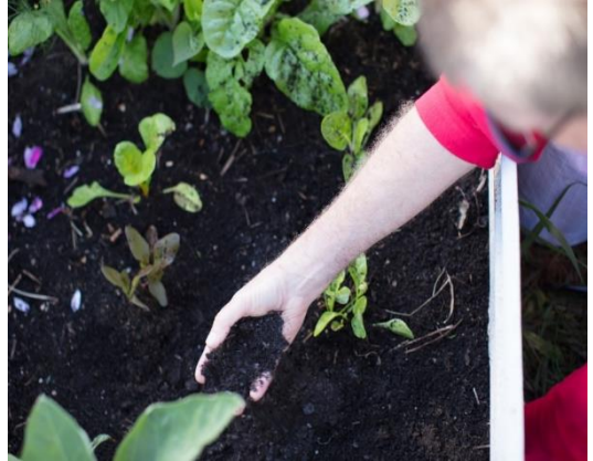
Photo: Local farmers and gardeners now have access to certified organic compost. (Byron Shire Council)