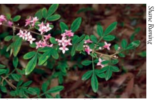
Threatened plant - Boronia umbellata

These measures are not aimed, per se , at protecting every individual animal or plant within a threatened species population, but seek to provide sufficient protection of key habitat and foraging resources to allow populations to remain viable and persist in perpetuity. This is essential to the maintenance of biodiversity.