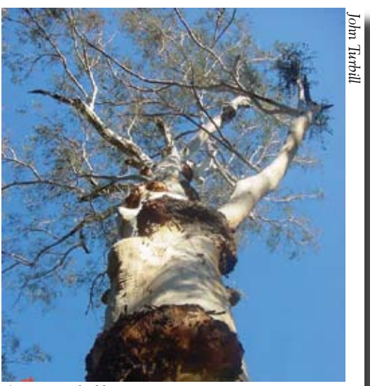
Senescent Blackbutt tree

Old growth forest on less fertile sites or old growth woodlands, whilst being not as diverse, are still characterised by a canopy of older trees (many with hollows) but with a sparser understorey and a groundcover of native grasses.