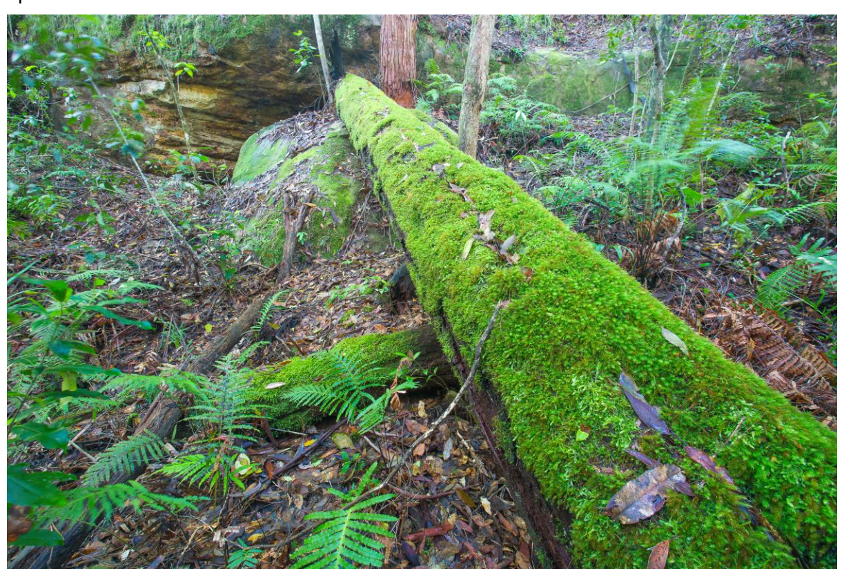
State Forest near Port Macquarie.

The government also consulted with experts outside the expert panel. This was to ensure that adequate evidence and information was obtained on the suitability of the proposed TSL framework for threatened species and their habitats that are likely to be affected by forestry operations in the Coastal IFOA area.