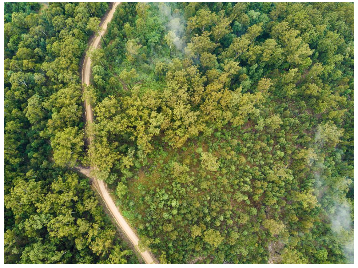
Port Macquarie forest aerial.

A full report on the Coastal IFOA trial scope, the methods applied and outcomes will be made publicly available with the release of the draft Coastal IFOA.