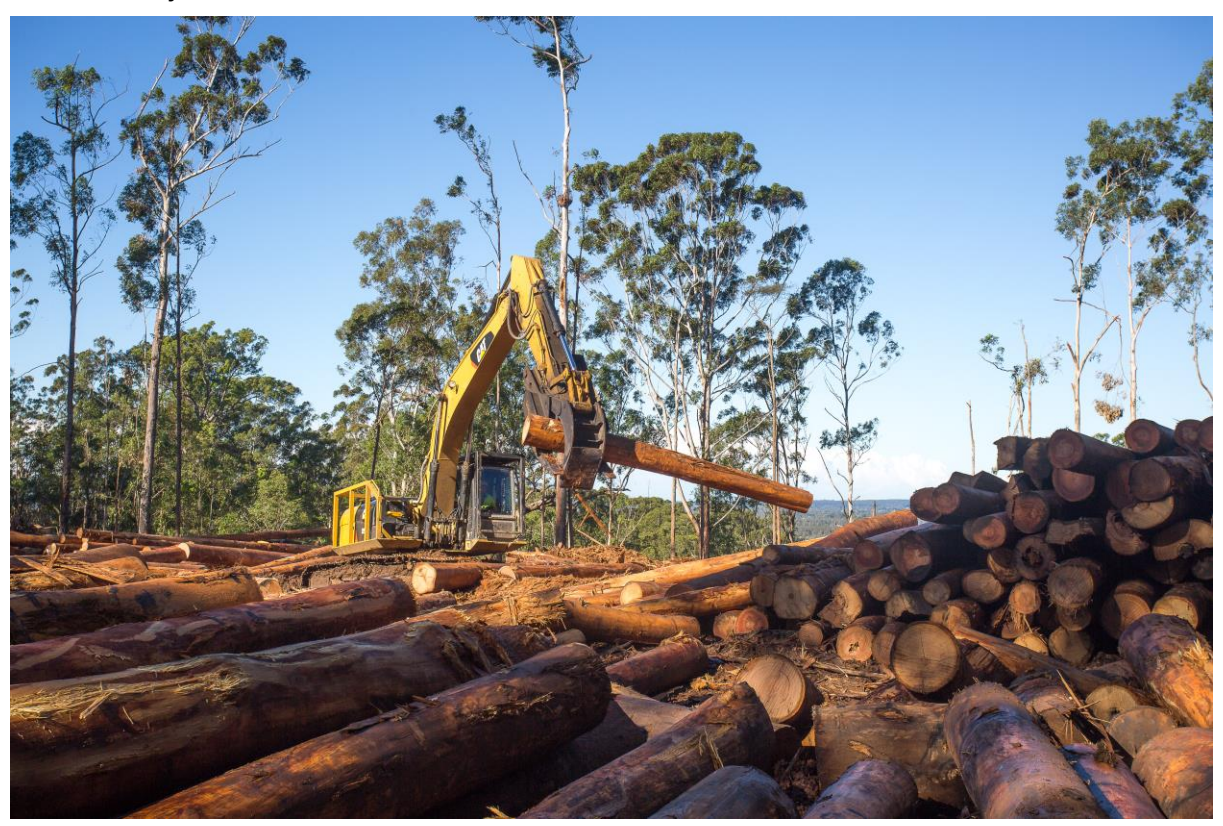
Sawlogs in a State Forest near Port Macquarie on the NSW North Coast.

In reviewing and providing information and advice, the expert panel considered the IFOA remake's objectives listed under '1. Overview'.