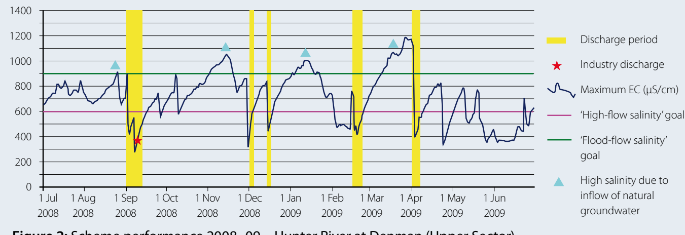
Figure 2: Scheme performance 2008–09 – Hunter River at Denman (Upper Sector)

In total, there were five periods during the year when mines in the Upper Sector were allowed to discharge salty water. However only one mine used its credits to discharge on a single day. During this discharge period, the salt level in the river remained well below the high flow salinity target ensuring that the water was suitable for local irrigation.